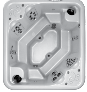
C850LED 84" W x 96" L x 36" H