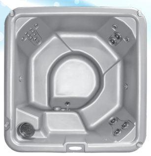
C650LED 80" W x 82" L x 35" H