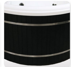
Stainless Steel Banding (only available on round models)