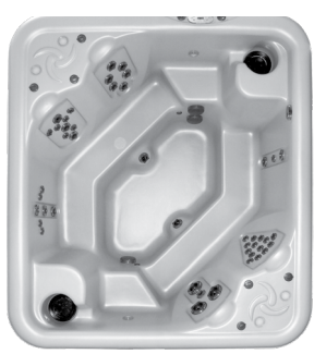
C850LED 84" W x 96" L x 36" H