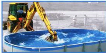
A vigorous backhoe test is performed prior to the launch of each new pool.

The Engineering design of the Channel-Lok II buttress system has been developed to require fewer buttresses without compromising its strength and reliability. Along with Atlantic's unique structural system and fewer buttresses, the Channel-Lok II buttress system will be appreciated for its good looks and ease of installation. This buttress system can be installed on a flat concrete surface. There is no excavation or digging needed on a flat compacted level surface.